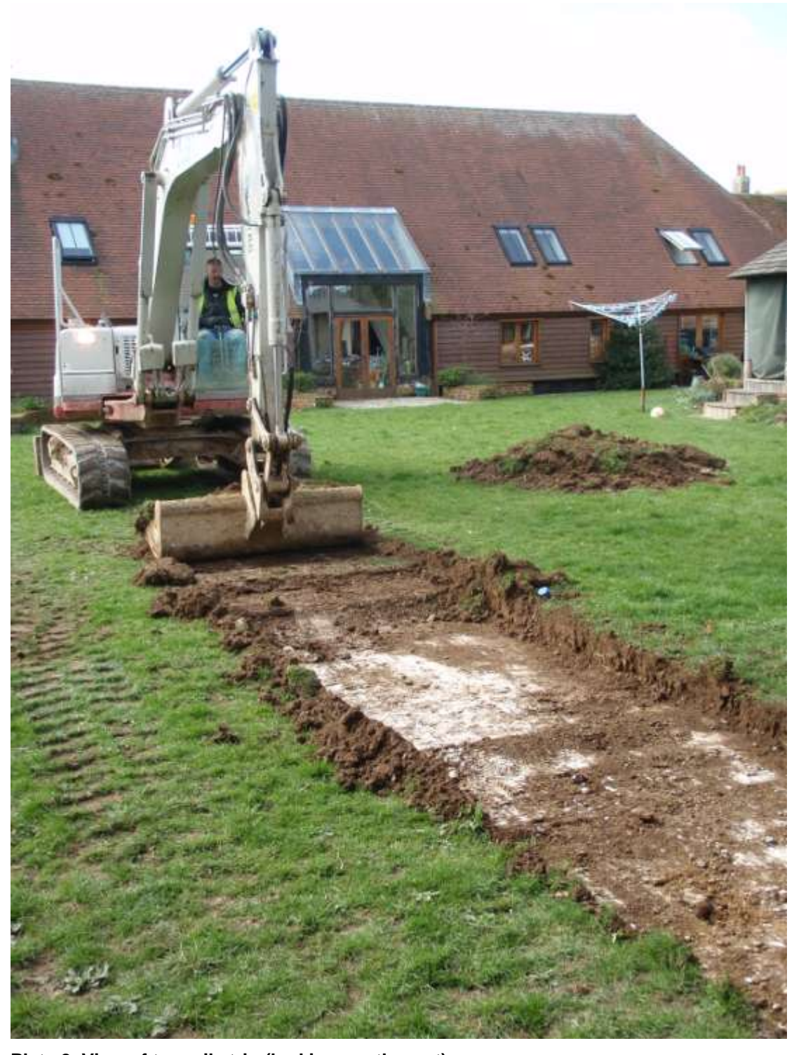
Plate 2. View of topsoil strip (looking south-west)