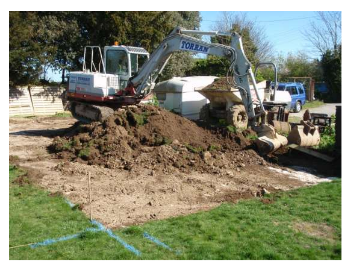
Plate 3. View of topsoil strip (looking north-east)