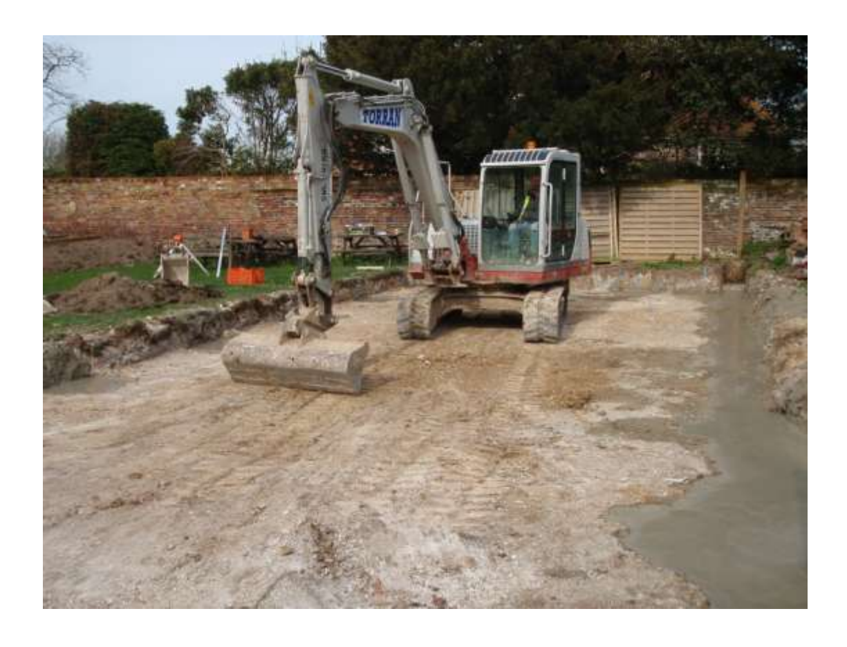
Plate 4. View of ground reduction (looking north-west)