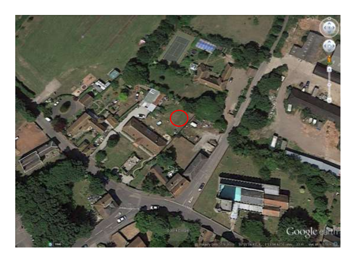
Plate 1. Area of Investigation (circled in red). Google Earth, 7/9/2013 eye elevation 179m.